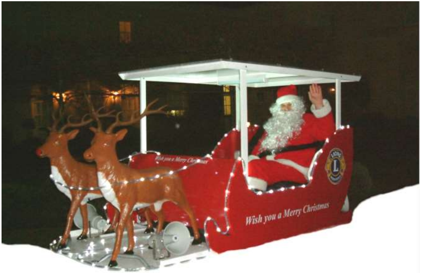
Christmas Greetings from Lechlade & District Lions Club